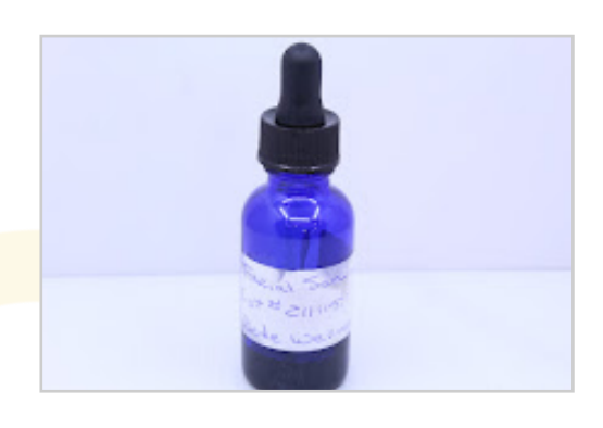
Unit: 1oz (28g) | Units Per Package:1

Analyzed via AAM-001 using Agilent 1220 HPLC-DAD. Limits are based on CO 6 CCR 1010-21. Sample was analyzed as received. Deviations from SOP: None.